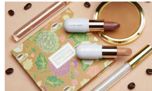
Winky Lux Coffee Collection