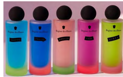
Eckhaus Latta "Possessed"