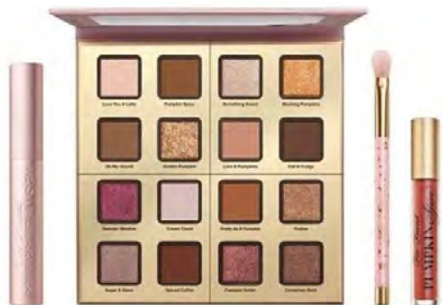
Too Faced Pumpkin Spice