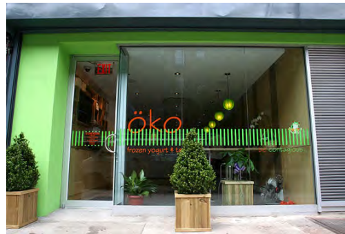
OkO Frozen Yogurt & Tea