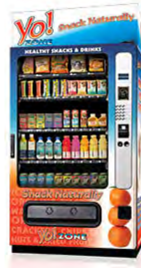
Yo Naturals Vending Machine