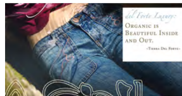
Del Forte Denim