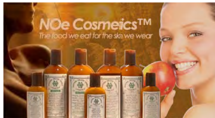
NOE (Natural Organic Edible) "Skin Food. The food we eat for the skin we wear"