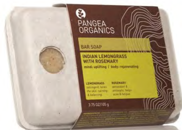
Pangea Organics Bar Soap