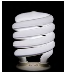
Energy Saving Light Bulb