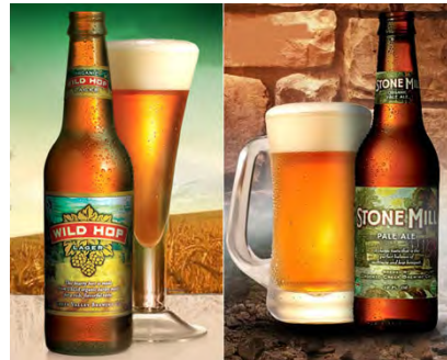
Wild Hop & Stone Mill Organic Beers