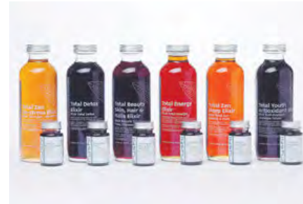
Sephora Health & Beauty Bar