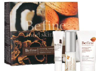
Befine Food Skincare