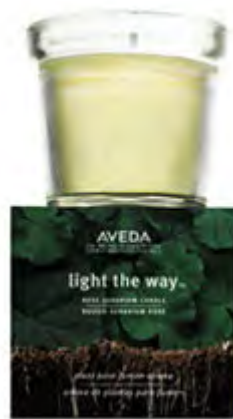
Aveda Light the Way Candle