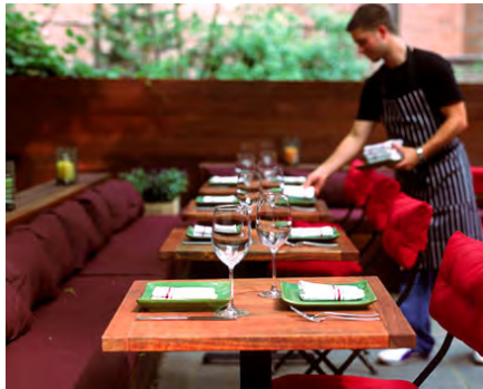
Pure Food & Wine