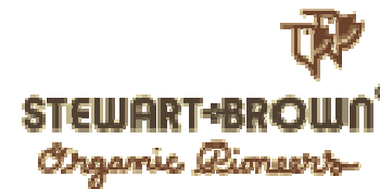
Stewart + Brown