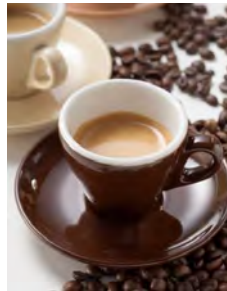
Fair Trade Coffee