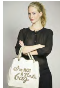
I'm not a plastic bag