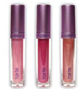
Borba & Tarte Inside & Out