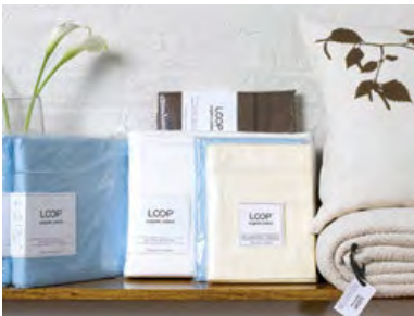
Loop Organic Cotton