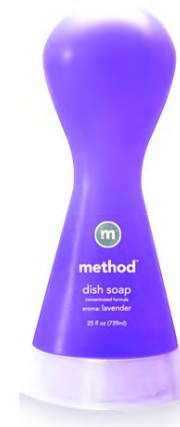
Method Dish Soap