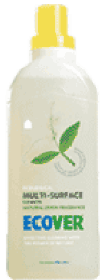
Ecover Multi Surface Lemon Cleaner