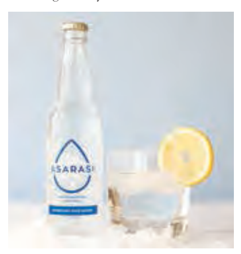
Asarasi is an all-natural, tree-filtered, sparkling tree water that comes directly from maple trees.

with a natural pH of 7.7. The water is mineral-rich because of the natural filtration through scoria, a basaltic volcanic rock, which fortifies the water with calcium, potassium, magnesium and vanadium. Core Hydration, the new ultra-purified water, uses a sevenstage proprietary process including