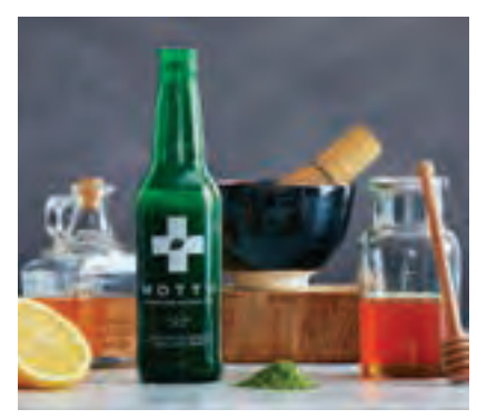
Motto Sparkling Matcha Tea is formulated with premium matcha, honey, organic agave, apple cider vinegar and fresh lemon juice.

the world's first bottled matcha drink" made with premium matcha, honey, organic agave, apple cider vinegar, and fresh lemon juice. Teapigs offers a Matcha Super Power Green Tea Drink in three formulas: Apple, Elderflower, and Grapefruit . Jade Monk offers on-thego, flavored and lightly sweetened, powdered