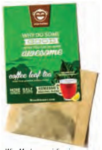
Wize Monkey specializes in the production of coffee leaf tea.

Coffee byproducts are spilling over into tea. Coffee leaf tea is made from coffee leaves, which are turned into a tisane. Coffee leaf tea is reported to have 17% more antioxidants than green tea. The flavor is described as "the body