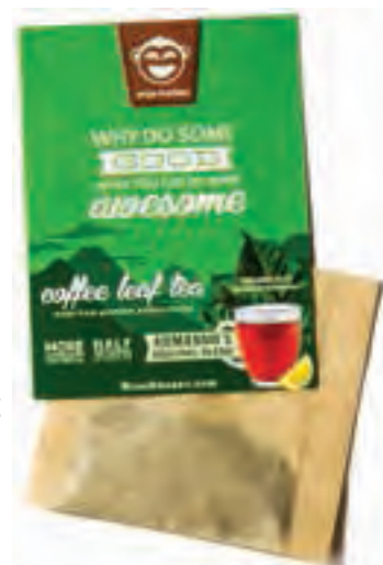
Wize Monkey specializes in the production of coffee leaf tea.

Coffee byproducts are spilling over into tea. Coffee leaf tea is made from coffee leaves, which are turned into a tisane. Coffee leaf tea is reported to have 17% more antioxidants than green tea. The flavor is described as “the body