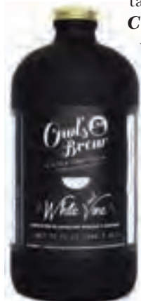
White and Vine made with white-tea, pomegranate, watermelon and lemon peel joins Owl’s Brew line of premium tea-based mixers.

Tea is brewing on cocktail menus and pairs well with alcohol. Owl’s Brew is a line of premium tea-based mixers self-described as “the first-ever artisanal tea crafted for cocktails.” The line is available in four offerings: