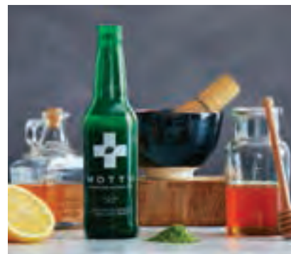
Motto Sparkling Matcha Tea is formulated with premium matcha, honey, organic agave, apple cider vinegar and fresh lemon juice.

Matcha is emerging in the RTD market; expect to see more beverages readily available. “Tea products have incorporated Chinese-inspired flavors, such as matcha green tea, hibiscus, and Pu-erh tea,” says Piazza. Motto Sparkling Matcha Tea “is the world’s first bottled matcha drink” made with premium matcha, honey, organic agave, apple cider vinegar, and fresh lemon juice. Teapigs offers a Matcha Super Power Green Tea Drink in three formulas: Apple, Elderflower, and Grapefruit. Jade Monk offers on-the-go, flavored and lightly sweetened, powdered