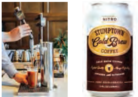
Stumptown Nitro on tap and Cold Brew Nitro canned.

Craft coffee is taking cues from the craft beer movement and cold coffee is being offered on tap. Nitro is the emerging cold brew application aptly described by Bon Appétit as "pulled from a tap, nitro is cold brew infused with nitrogen to create a smoother, creamier drink." District: Donuts. Sliders. Brew. in New Orleans offers a nitro brew on tap, while Chocolate Fish Coffee Roasters of Sacramento dubs their nitro brew as Morning Beer . Stumptown features a nitro cold brew on tap, which is described as a "bubbly coffee drink that has a head of foam, similar to a pint of brew." In April, the company released a Stumptown Nitro Cold Brew