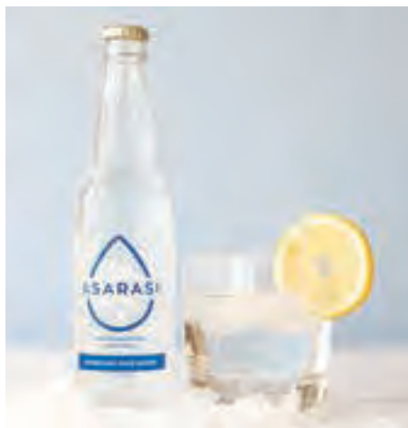
Asarasi is an all-natural, tree-filtered, sparkling tree water that comes directly from maple trees.

Nothing Water launched in June and is sourced from the Isbre Springs beneath the 5,000-year-old Hardanger Glacier in the Osa Valley of Hardanger Fjord, Norway. Jeju 16 by On Corporation Inc. is a natural volcanic mineral water from Mt. Halla, which has passed through 16 layers of volcanic bedrock with a natural pH of 7.7. The water is mineral-rich because of the natural filtration through scoria, a basaltic volcanic rock, which fortifies the water with calcium, potassium, magnesium and vanadium. Core Hydration , the new ultra-purified water, uses a seven-stage proprietary process including